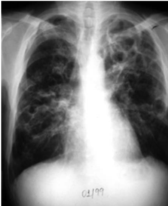
Figure 2 - Chest X-ray showing bilateral lung opacities predominantly in the middle lobes and with cavitation in the left upper lobe. Case of paracoccidioidomycosis concomitant with tuberculosis (acid-fast bacilli positive).

the anti-TB treatment, the patient again complained of fever, weight loss, mild productive cough, and dyspnea. Recurrence of PCM was confirmed (Figure 5), and the treatment with trimethoprim-sulfamethoxazole was restarted.